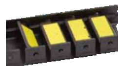
This style relies on colored stickers applied to plastic flags