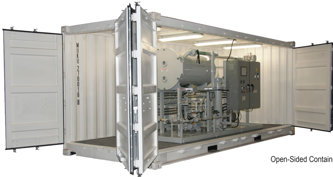
Open-Sided Container Mount Option