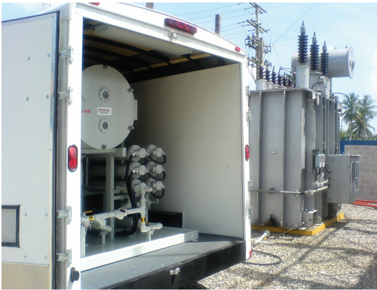
Cargo Trailer Mount Option