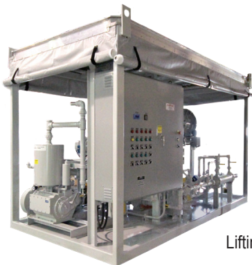
Lifting Frame with Tarpaulin Option

This method is more efficient than previously used spray nozzles and baffles, which required several passes to obtain the same degree of degasification.