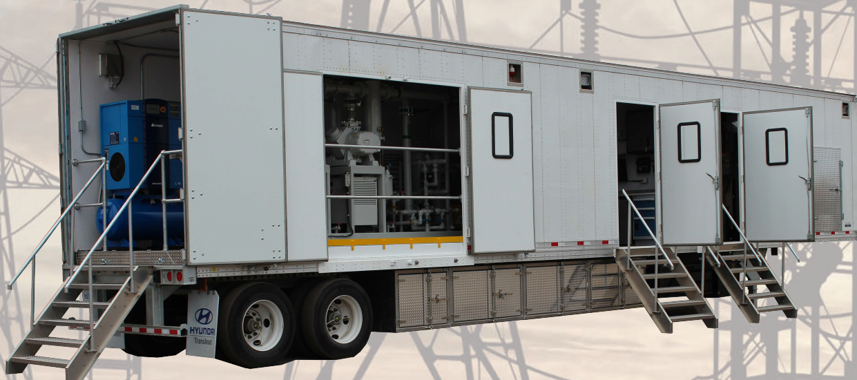
Semi Trailer Mount Option

RECOVERY AND PURIFICATION SOLUTIONS THAT WORK FOR YOUR BUSINESS