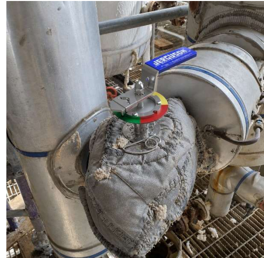
The extended stem option keeps handle, and indicator outside the insulation envelope, allowing the valve area to be fully insulated and finished consistently with the surrounding process piping.