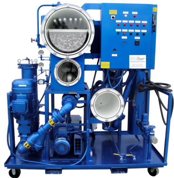
Representative 50 GPM VDOPS

A small transfer pump equipped with a 3-Micron filter element was placed on the gearbox to pump the lube oil into the main tank. A 50 GPM Vacuum Dehydration Oil Purification System (VDOPS) from Oil Filtration Systems®, equipped with a high efficiency 5-Micron Beta >1000 filter element, was placed on the main tank to re-circulate the oil for 48 hours, dropping the particle count from ISO 24/23/20 to ISO 9/8/7. A “flush” of the lube oil piping was then performed, dislodging more debris and returning it to the reservoir, resulting in a spike of particle counts in the oil. The VDOPS continued to re-circulate on the main tank for another 24-hours, and ultimately achieved a final particle count of ISO 10/9/8 (or NAS Class 0), far exceeding the required cleanliness specification of ISO 16/14/11 (NAS 5).